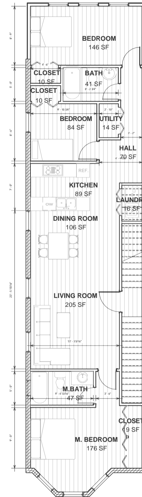
3 SECONo FLOOR PLAN UNIT#3 3 16 1 0